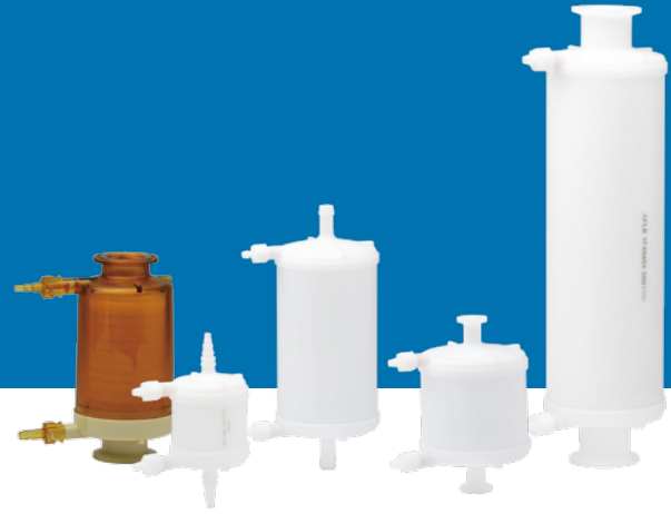
Air Flow Rate - Cobetter Aegivast AFM Bricap L03 Capsule